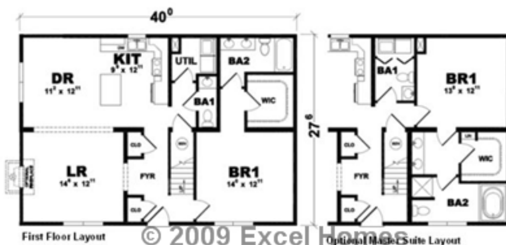
First Floor Layout